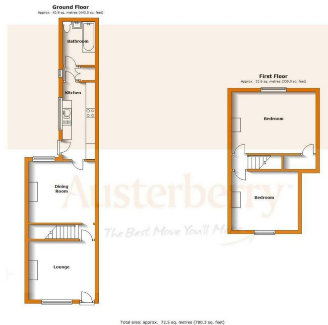
Total area: approx. 72.5 sq. metres (780.3 sq. feet)

To arrange a viewing or for any further information, please contact Austerberry on 01782 594595 or e-mail enquiries@austerberry.co.uk